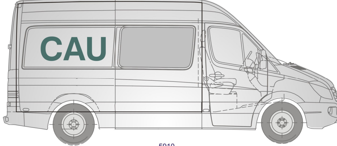
VISTA EXTERNA LATERAL